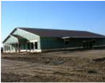
Work is progressing on the new Post Office in Aubrey behind FSB.

Comprehensive Planning Committee – responsible for land use review and recommendations