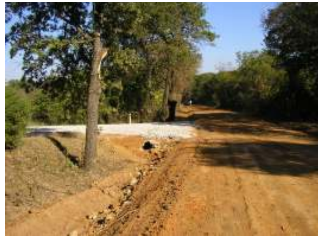
Work being done on Mill Creek Road is a great improvement.